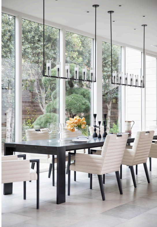
Channel-tufted armchairs in the modern dining area. Below, a new backyard patio and pool anchor the home's more contemporary facade.

Concerned about making the home as sustainable as possible, they used reclaimed materials when feasible, for both furnishings and interior details. The former barn in back proved to be beyond repair. But they built a new one just like it to serve as a garage and kept the old-vine wisteria that had been growing there. A former chicken coop was turned into a guest cottage, equipped with a battery-powered unit that feeds off a solar electric system to provide an off-the-grid refuge if they ever need it.